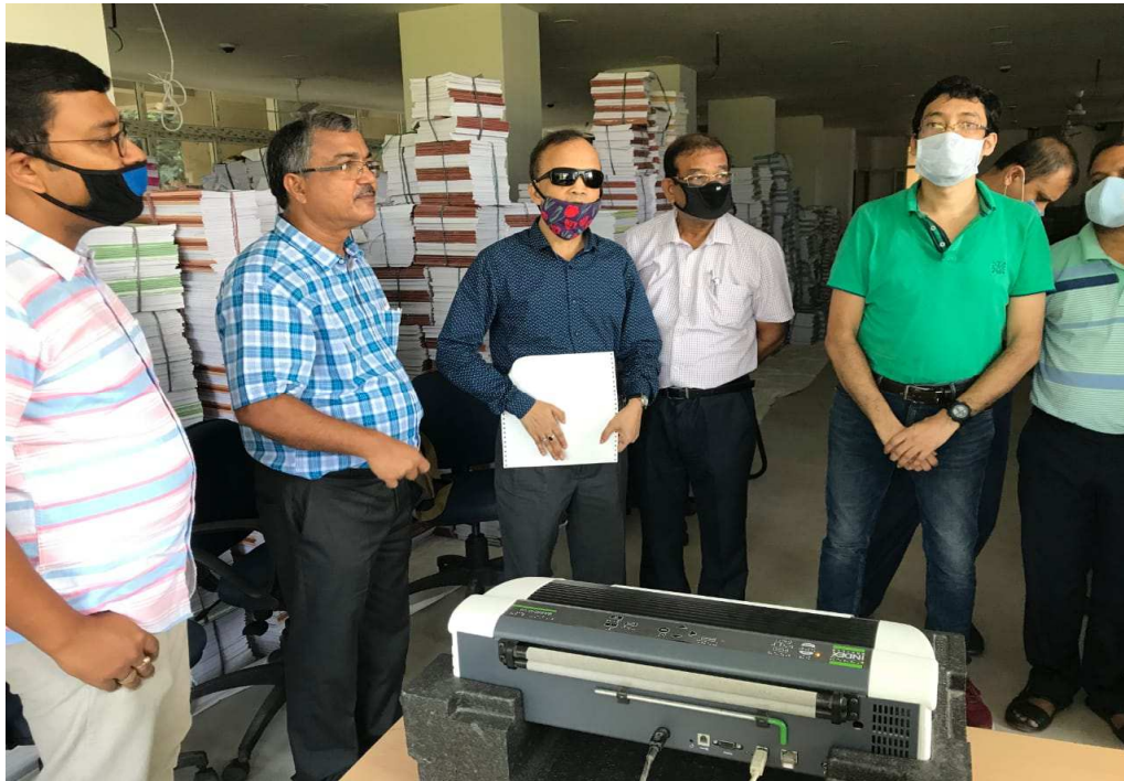
Photographs of the Braille machine at University campus